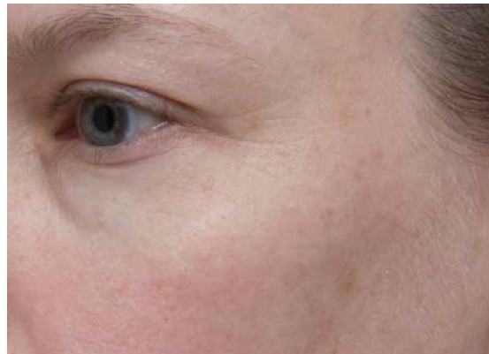
AFTER 10 MINUTES