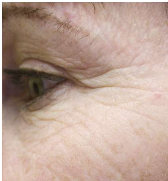
AFTER 2 WEEKS