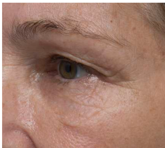
AFTER 4 WEEKS