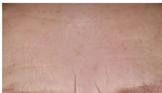
AFTER 4 WEEKS