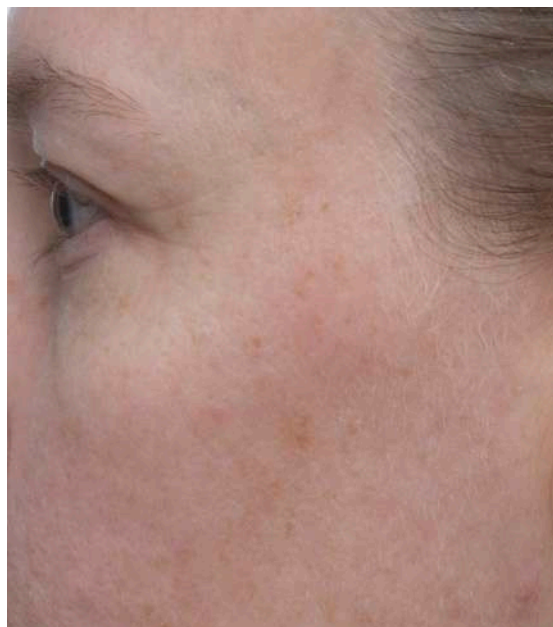
AFTER 10 MINUTES