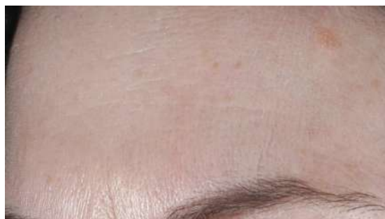
AFTER 4 WEEKS