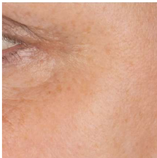
AFTER 4 WEEKS