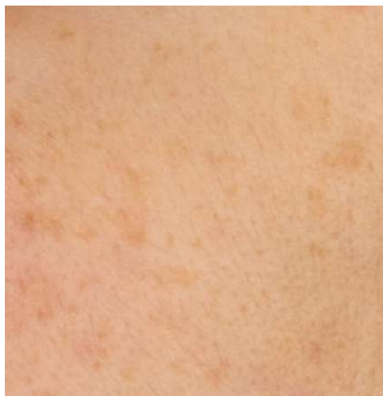
AFTER 2 WEEKS