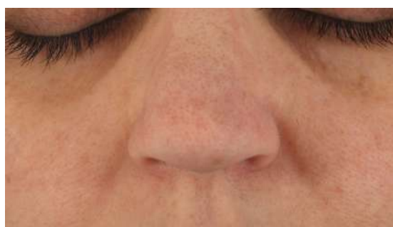
AFTER 4 WEEKS