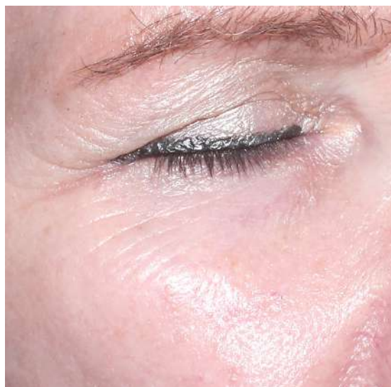
AFTER 6 WEEKS